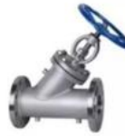
Y- Globe Valve